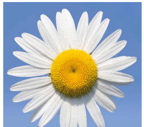
Easy to Interpret