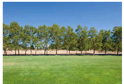
Horizon lines or non-abstract close-ups

What not to use is almost as important as what to use. We must avoid complicated or busy composition, distorted figurative work, out of focus photography, artwork with animal faces looking directly at the viewer, rocky or mountainous landscapes, Winter or Fall (end of life) and any indiscernible imagery such as all abstract artwork.