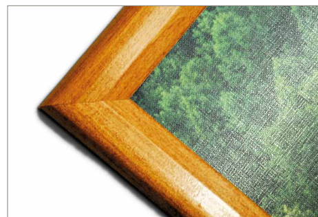
Frame Close-Up View