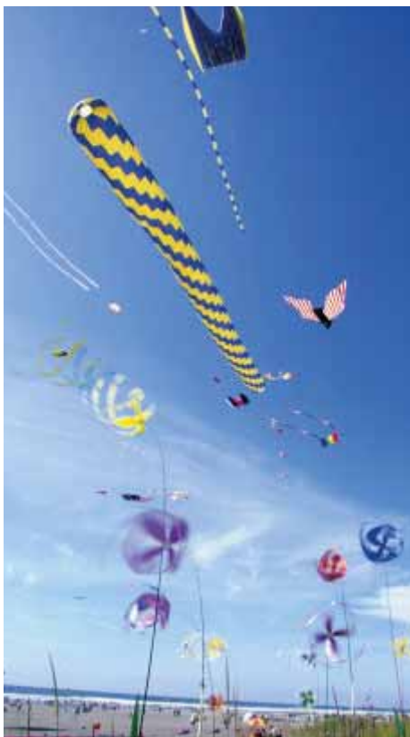
Full-color photography is highly recommended for these patient areas.