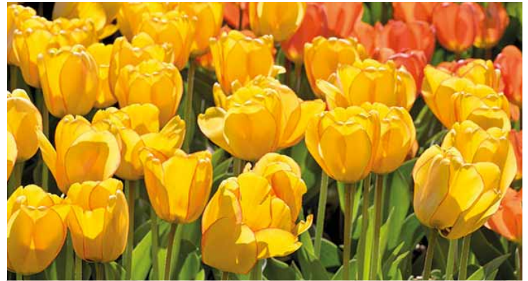
Based in nature - Water, Greenery, Grass, Floral = LIFE