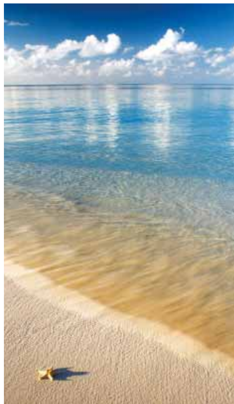
Bright / Sunny